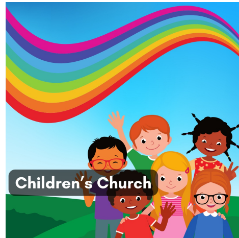
Children's Church (VIP Kids) Weekly - During Sunday Services Sign up your child/ren HERE