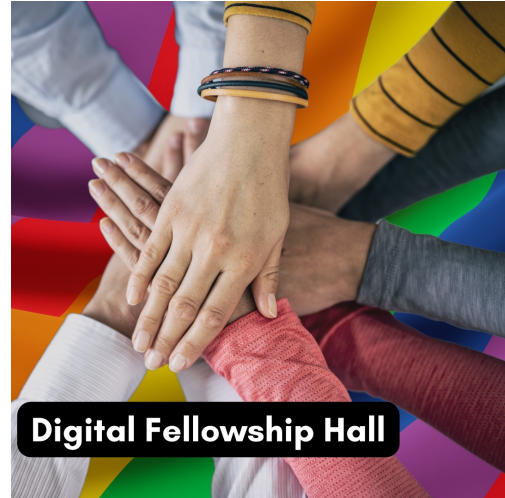
Digital Fellowship Hall