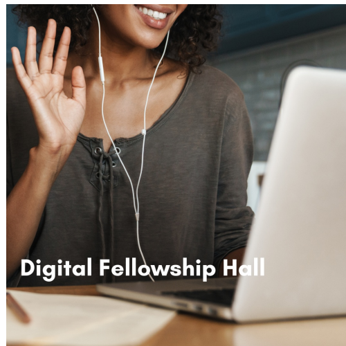
Digital Fellowship Hall