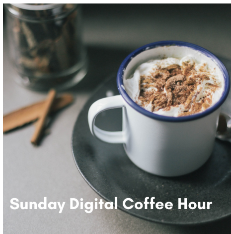
Sunday Digital Coffee Hour

10:30 AM - Ever Wonder Group Discussion (Email: everwonder@mcctoronto.com )