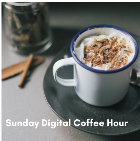
Sunday Digital Coffee Hour

10:30 AM - Ever Wonder Group Discussion (Email: everwonder@mcctoronto.com )