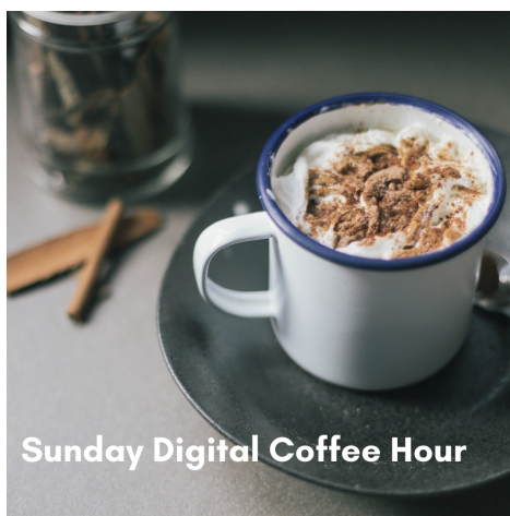
Sunday Digital Coffee Hour

10:30 AM - Ever Wonder Group Discussion (Email: everwonder@mcctoronto.com )