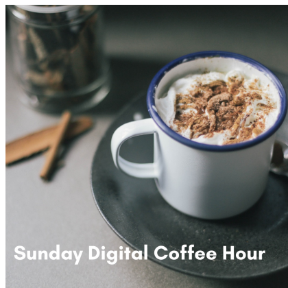
Sunday Digital Coffee Hour