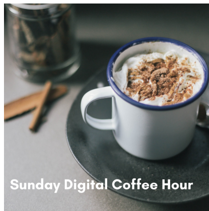
Sunday Digital Coffee Hour

10:30 AM - Ever Wonder Group Discussion (Email: everwonder@mcctoronto.com )