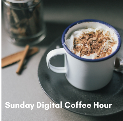
Sunday Digital Coffee Hour